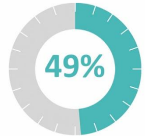
PERCENTAGE OF STUDENTS WANTING TO MOVE INTO EMPLOYMENT