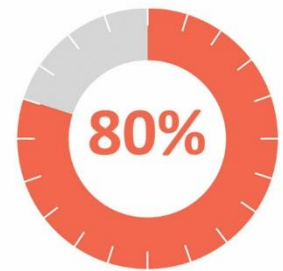
FEEL THEY HAVE BEEN GIVEN MORE SKILLS TO ACCESS SERVICES