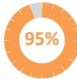
FEEL THEY HAVE BEEN GIVEN MORE SKILLS TO SECURE A JOB